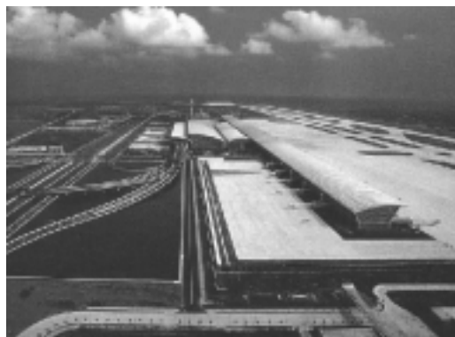
Shanghai-Pudong International Airport, China