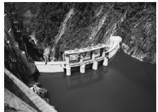
Asahan Electric Power Development, Indonesia