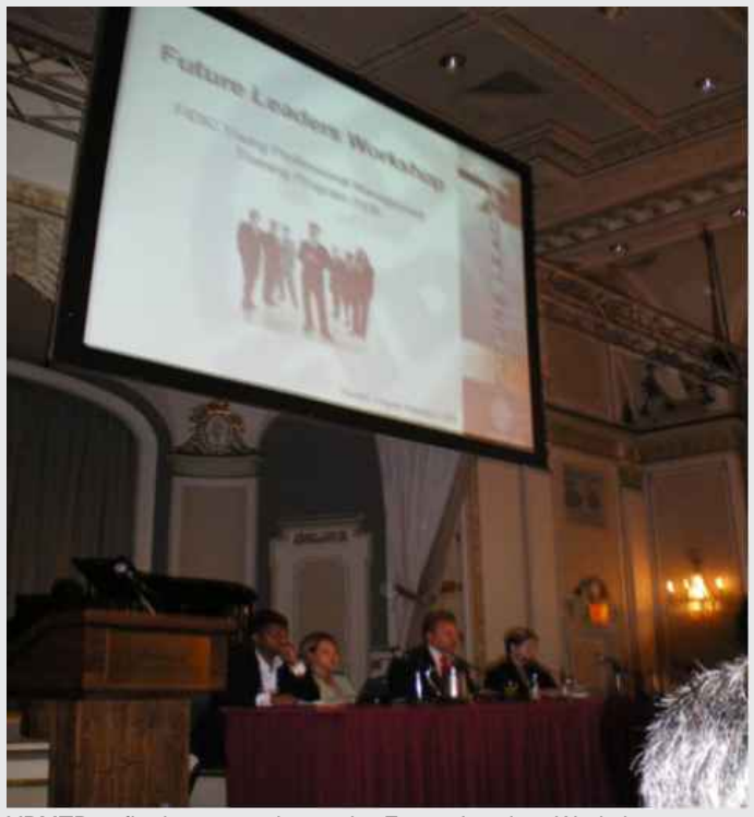
YPMTP08 final presentation at the Future Leaders Workshop

FIDIC is currently accepting applications for the 2009 programme. For more information visit: http://ypf.fidic.ch/training/Pages/default.aspx