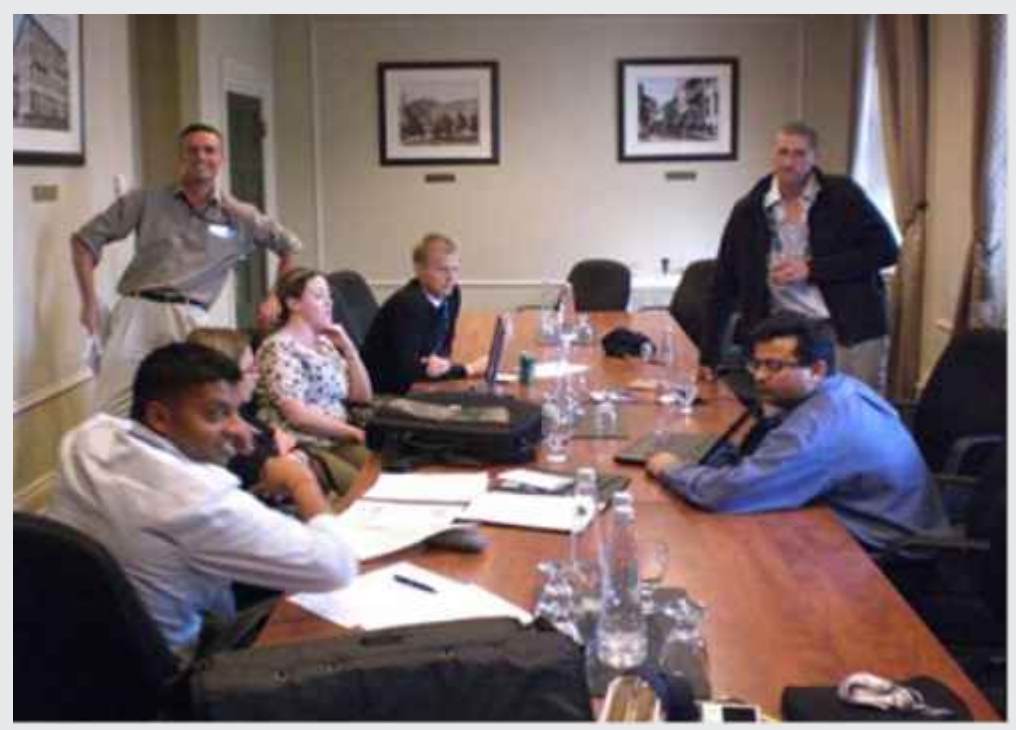
YPMTP08 participants preparing for their final presentation in Quebec City

The overall experience in participating in the YPMTP is proved to be very valuable. Not only are participants able to develop a solid international network of young professionals, but they are also able to learn from the top senior leaders in the industry. They are given insight to what's to come later on in their careers as well as applying the management skills learned in their day to day work. Attending the annual FIDIC conference also allows participants to attend other workshops and seminars on a wide variety of issues related to the consulting industry.