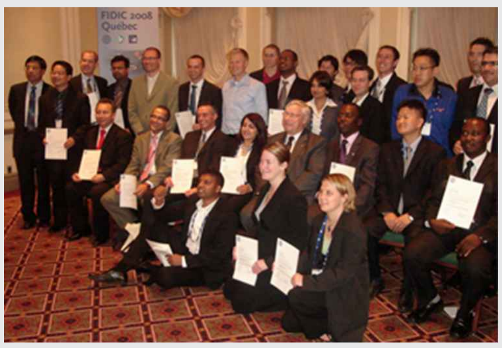
YPMTP08 award of certificates